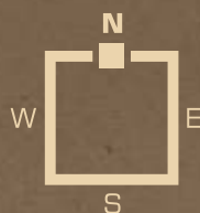
Typical Plan 2nd, 4th, 6th & 8th Floor